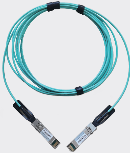
Appearance of VG-SFP-AOCXM